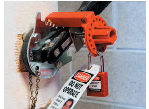
Butterfly Valve Lockout Devices