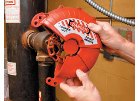
Collapsible Gate Valve Lockout Devices