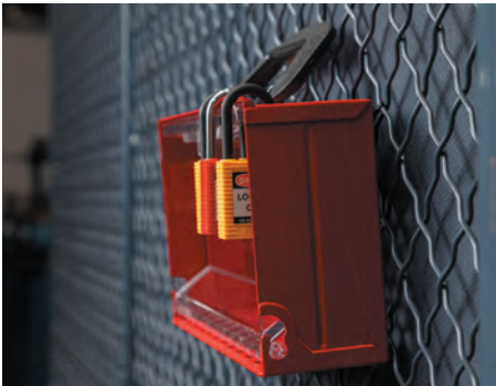
Group Lock Boxes