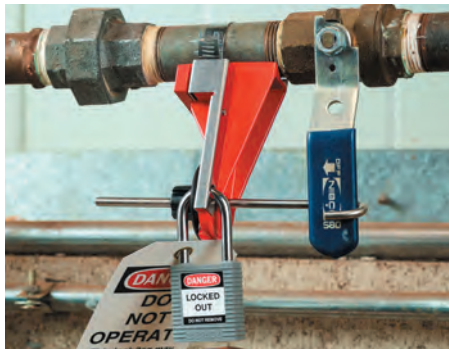
Ball Valve Lockout Devices