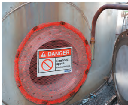
Confined Space Safety Covers