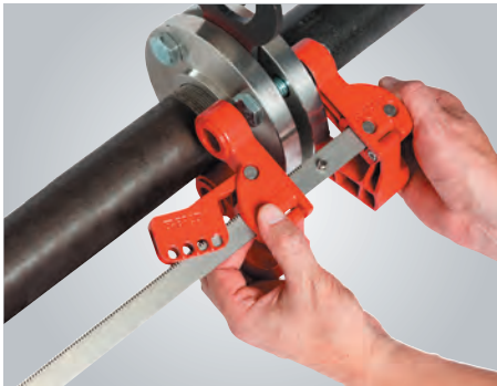
Blind Flange Lockout Devices