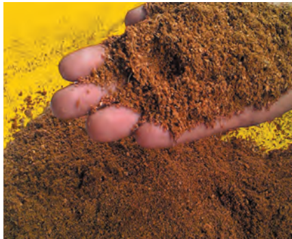
QUICKWIK™ Granular Absorbent