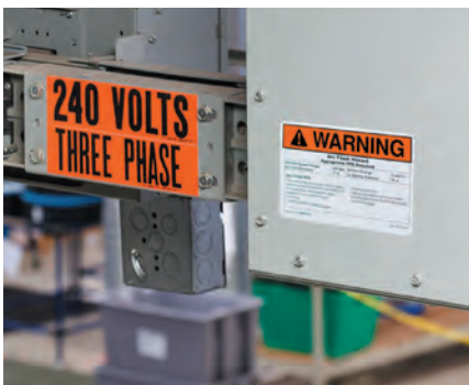
Arc Flash Labels