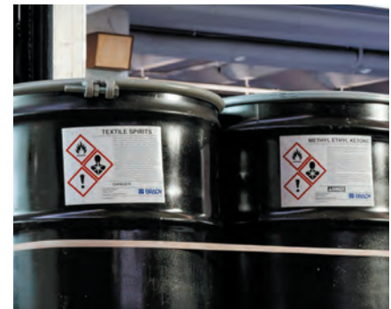
BS 5609 Compliant GHS Labels