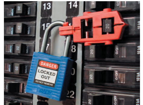
Circuit Breaker Lockout Devices