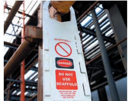
ScaffTag® Scaffold Management