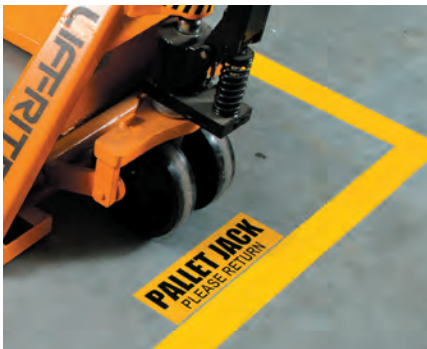
ToughStripe® Floor Marking