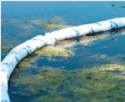
Absorbent Booms and Pillows