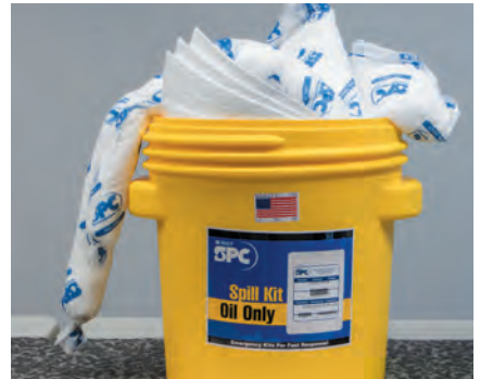
Spill Response Kits