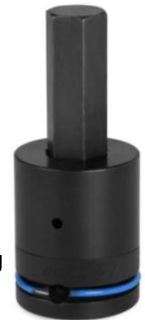
4A-620 w/optional retaining ring